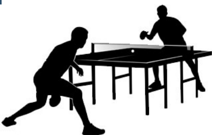
Table Tennis for adults returns on Monday 20th September (Juniors starting soon). The Bowls Club re-opens on Thursday 23rd September. Groups of 100 can return to indoor activities if fully vaccinated. If you intend to attend and are not fully vaccinated or recovered from Covid-19, please declare this to the organisers as it will then be necessary to run the clubs in pods of 6. Happy playing!