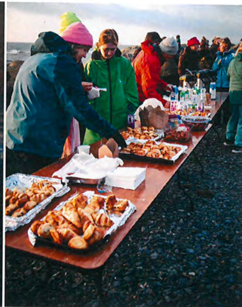
Easter morning on Newcastle Beach