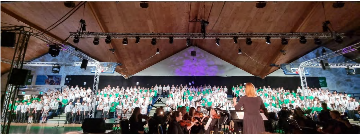
St. Francis' NS at the Wicklow Regional National Children's Choir