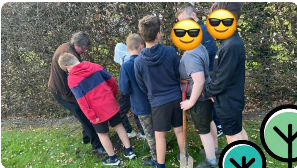
The Youth Club planting trees for Earth Day