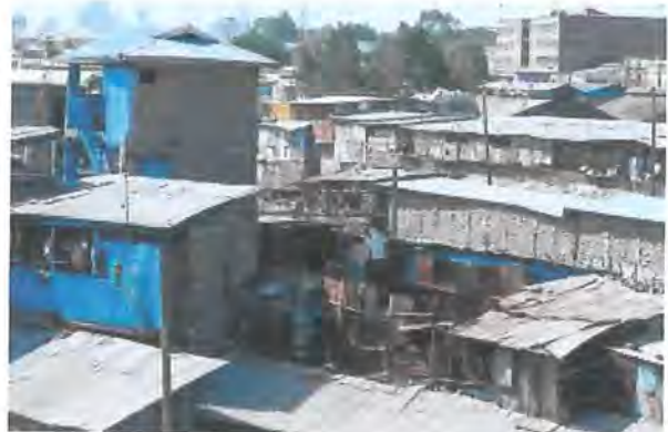
Part of Masai Village

We will continue to distribute to other villages in co-operation with government officials and village elders.