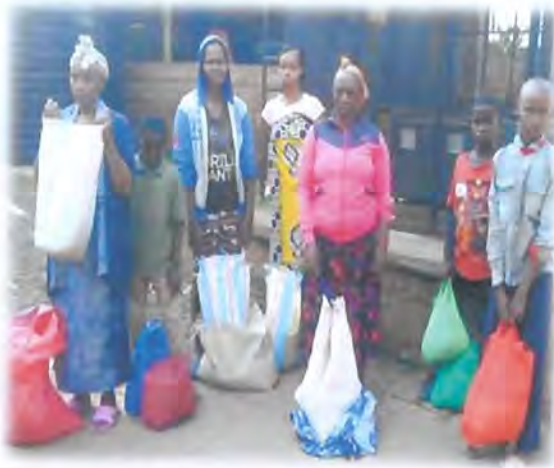
Families at Sancta Maria Mukuru Kayaba School

There was a second family of five members where the father has been jobless, the mother does bead work to make a living and the little she receives supports the family. For the month of March, she had no income as there is no one who can now buy her bead work. To her the food will help the family for some time but only hopes that the situation in the country gets better. Life at the moment is not easy for the family.