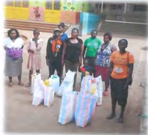
Families from St Elizabeth Primary

The staff of MPC and the Sisters are all well. We rejoice in our ability to assist at this time