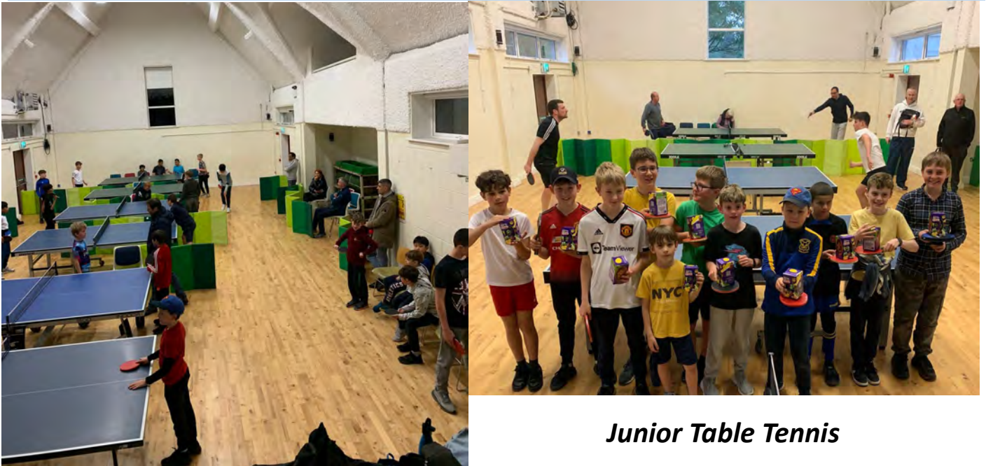
Junior Table Tennis

In future the keys will be signed out from the office so we can keep track of them.