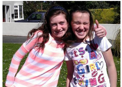
Members of the Junior Choir