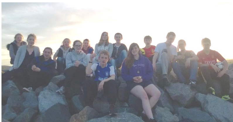
Youth Club BBQ on the Beach