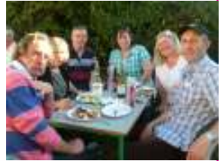
Church Lane Revellers at the barbecue

The choir singing 'Holy, Holy, Holy' at the Songs of Praise.