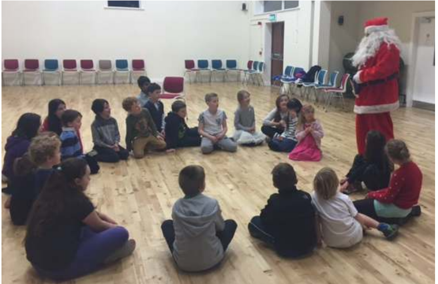
A visit from Santa