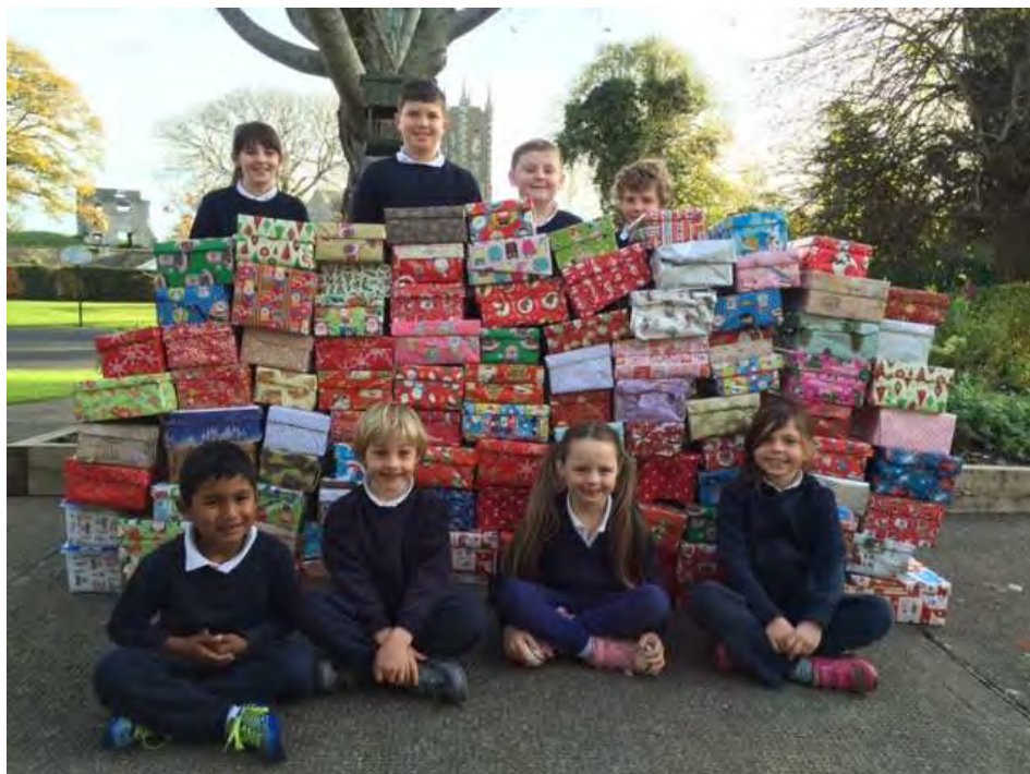
Some of the children from St Francis 'School displaying 108 shoeboxes collected for Team Hope